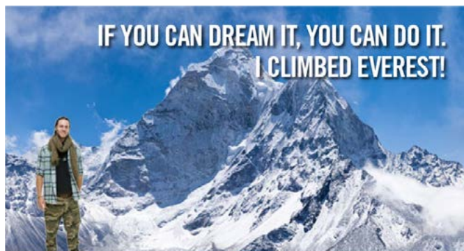
Motivational speaker backdrops