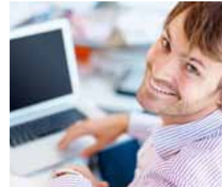
Our digital team combine innovative ideas with cutting-edge technology.