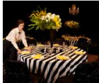
Our stylists are always on-trend.