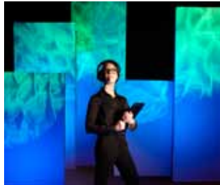
Our designers mix originality with sophistication.