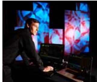
Our technical department's skills are first class.